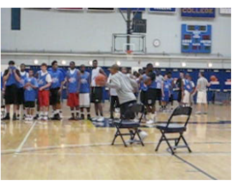
Get an Edge Division