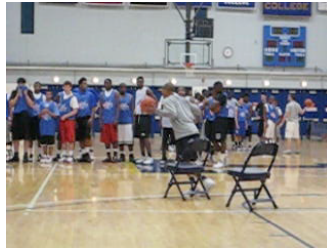
Get an Edge Division